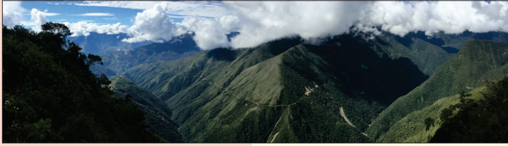
Road from the Altiplano to the Amazon Basin ; world's most dangerous road.