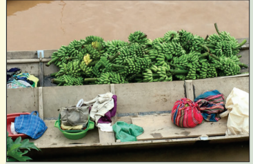
Shipping bananas to market on the Rio Beni.