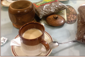
Coffee is produced in the foothills of the Andes. A steaming cup is a treat!