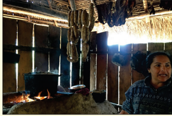
Rustic ranch kitchen . Mud fire stove & homemade sausage and jerky.