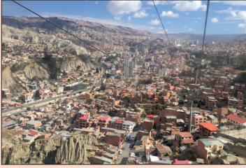
La Paz (capital), view from cable car.