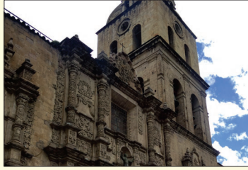
Cathedral of San Francisco ; an historic colonial cathedral in La Paz.