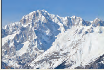
Mont Blanc - highest mountain in Europe