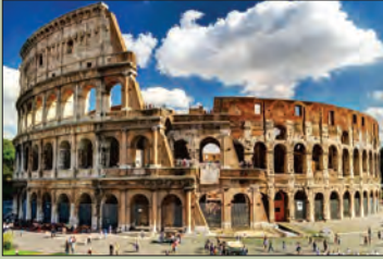
Rome - Italy's capital; the population is 29 million