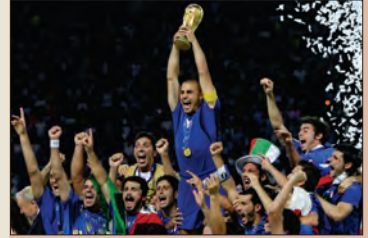
Soccer - the national sport