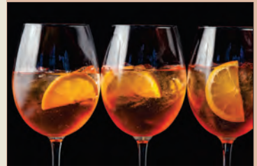
Spritz - pre-dinner drink