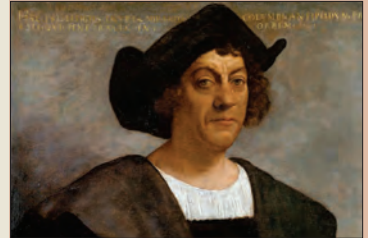
Christopher Columbus - he discovered America