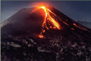
Etna - highest active volcano in Europe